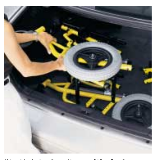
\label{lightweight} \textit{Lightweight aluminum frame with compact folding allows for ease} in transporting.